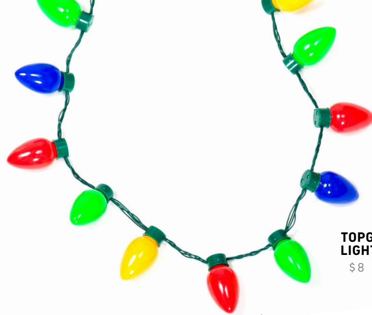
TOPGOLF HOLIDAY LIGHTS NECKLACE $8 PER GUEST