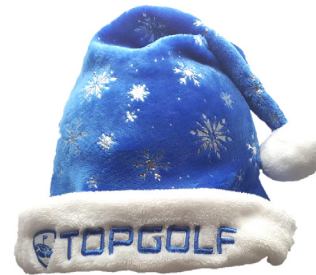
TOPGOLF HOLIDAY HAT $8 PER GUEST