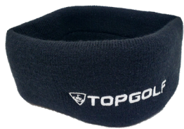
TOPGOLF KNIT HEADBAND $15 PER GUEST