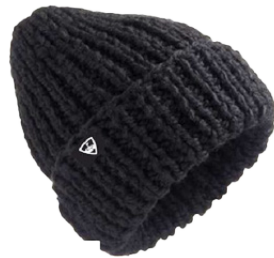
TOPGOLF KNIT BEANIE $16 PER GUEST